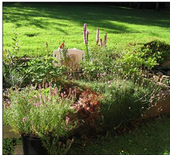
A Simple Mary Garden

Holy Mother Mary as the grandest one possible. It should be blessed by a priest.